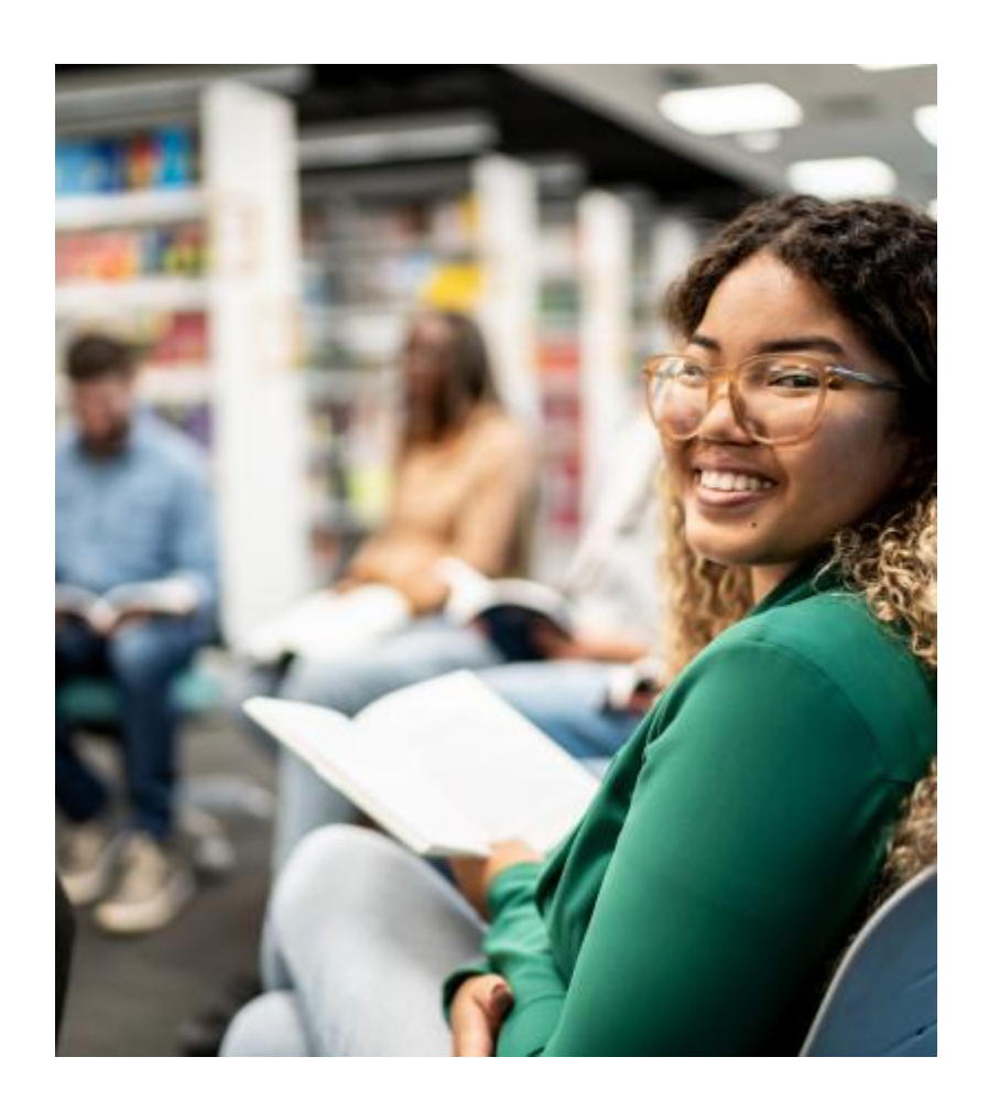
Reaching Teens through Passive Programming