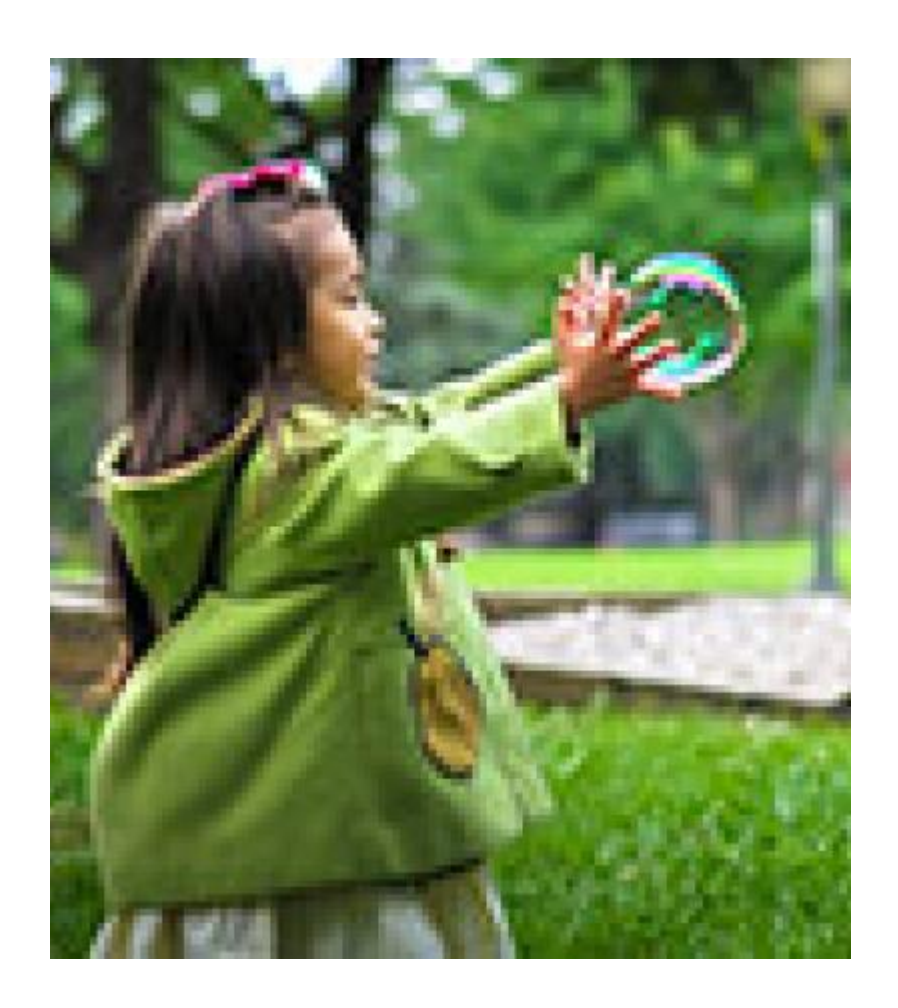
Parks & Rec: A Health Programming Partner

Audience Children (9 and under) Adults (21 and up) Aug 2, 2018 Young Adult (17 - 20)+ | Image