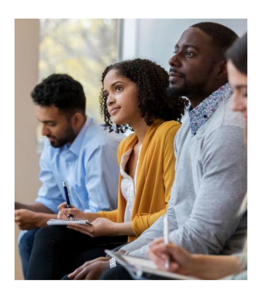
Collaborating with Local Businesses

Audience Young Adult (17 - 20) Adults (21 and up) Intergenerational