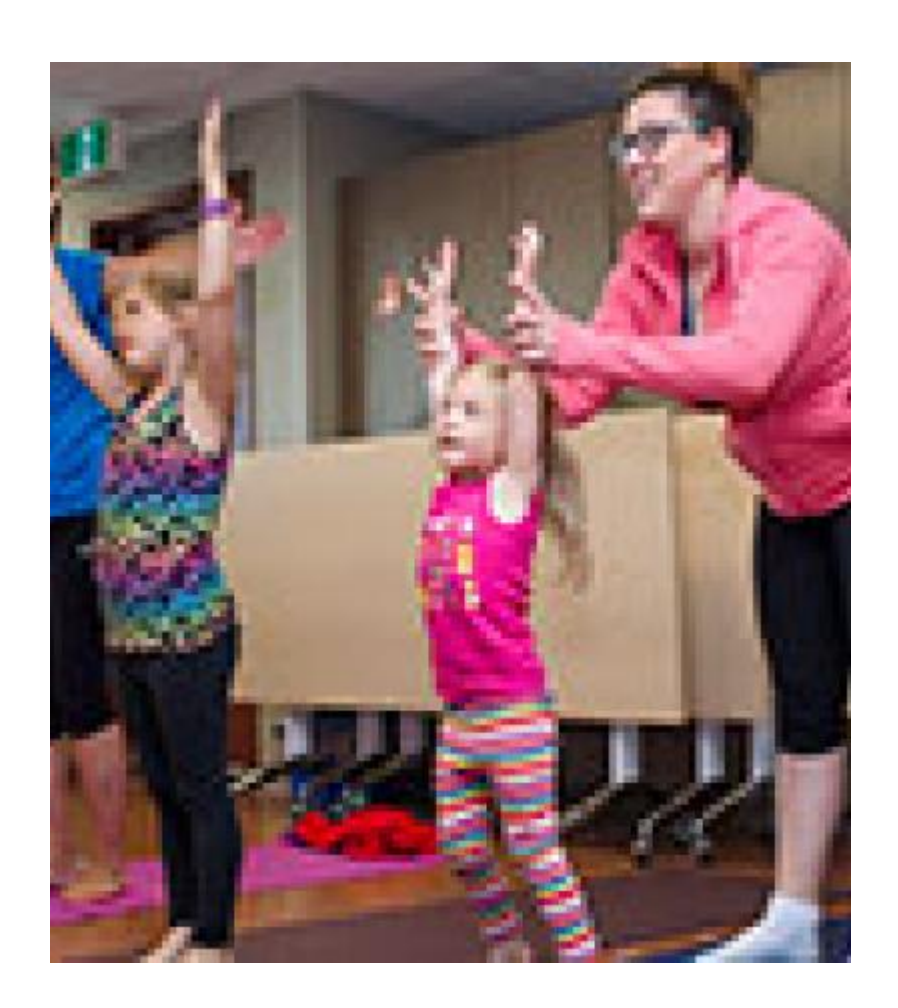
Family Yoga Party

Audience Children (9 and under) Jun 5, 2018 Children (9 and under)+ | Image