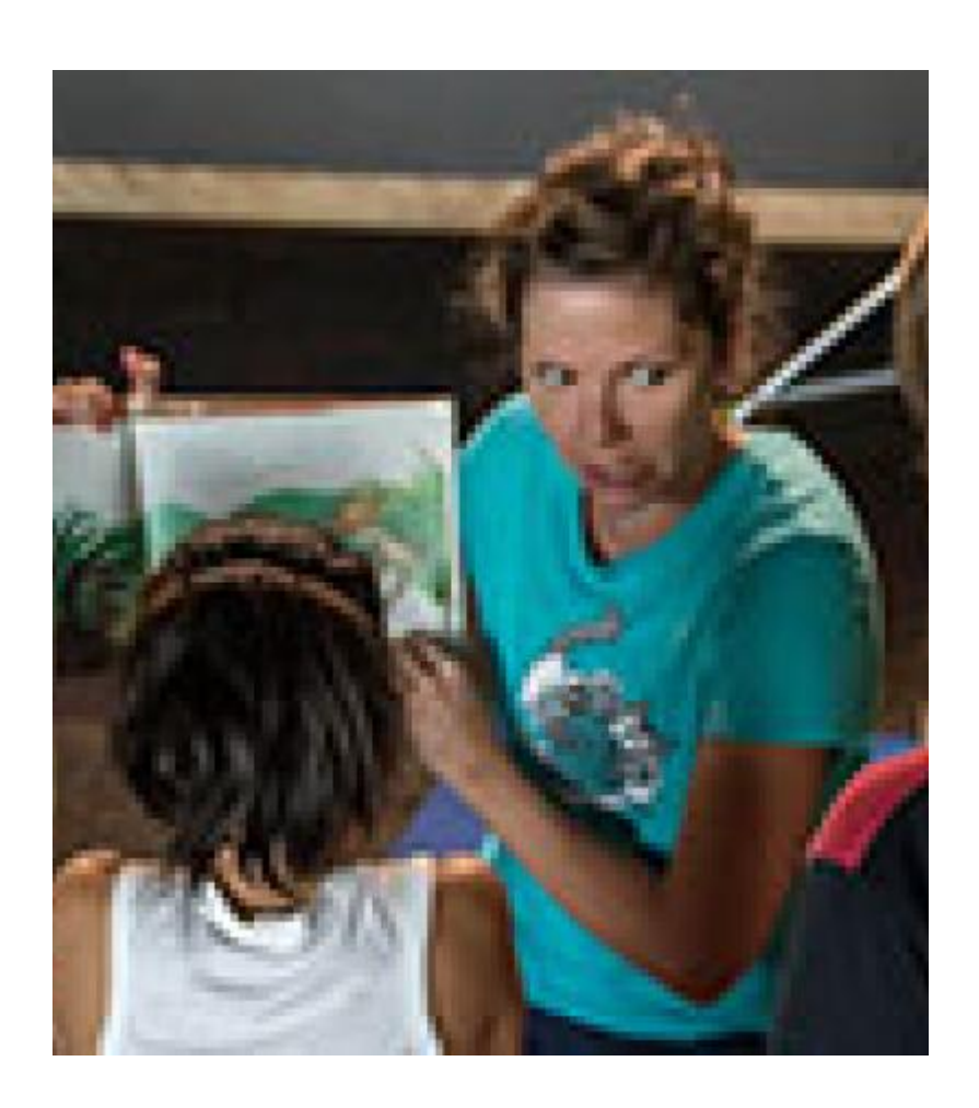
Books to Get Kids Moving

Audience Children (9 and under) May 25, 2018 Children (9 and under)+ | □ Image