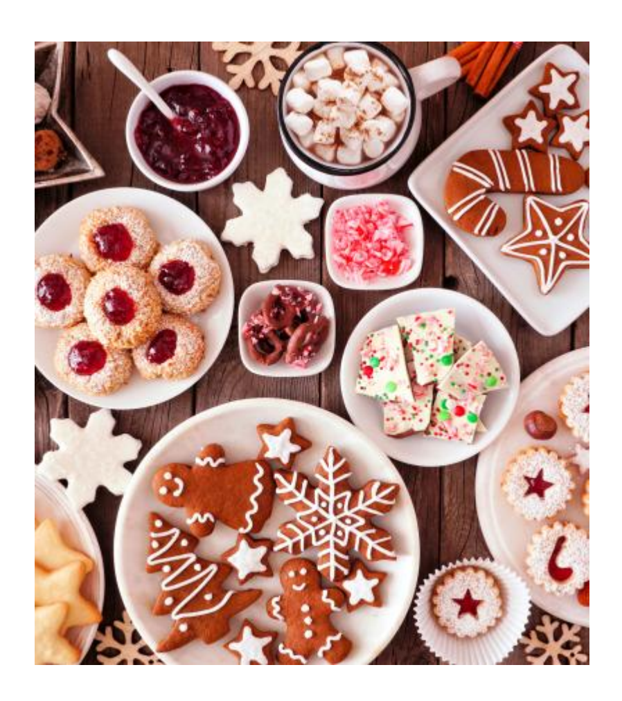
Nailed It / Failed It: Holiday Edition