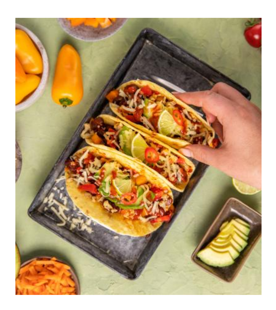
What's Cookin' at Bethesda Cookbook Club