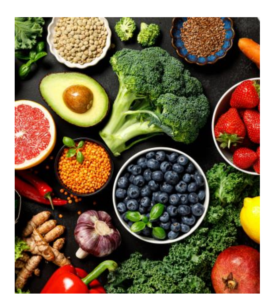
Taste of the Market