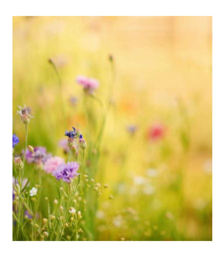
Inspiration Place: Spring Fantasy