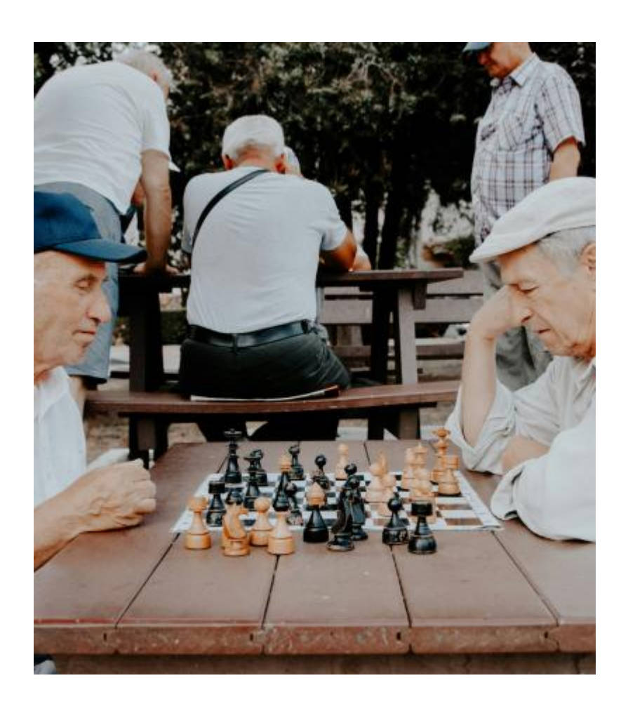
Two of a Kind: Author Pairings