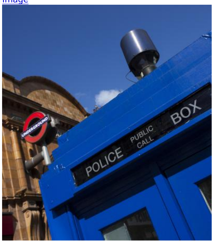
'Doctor Who' Trivia Contest