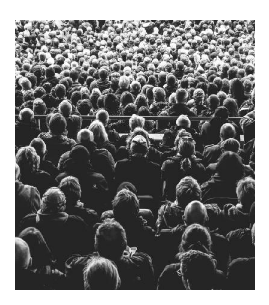
Authors @ your library