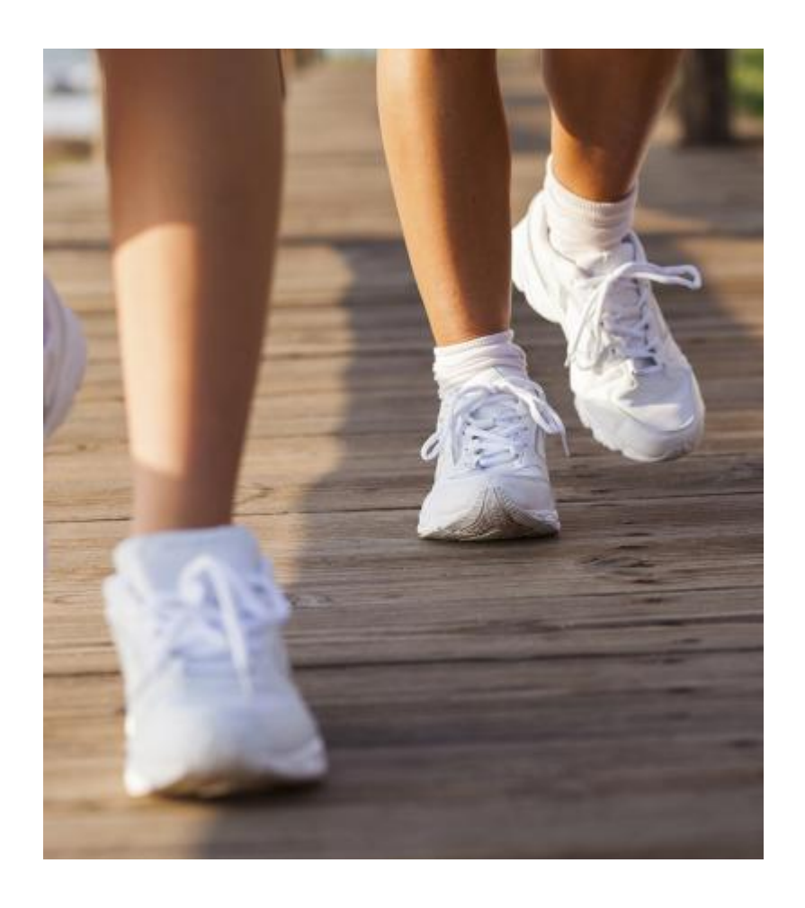
Roaming Readers Walking Club