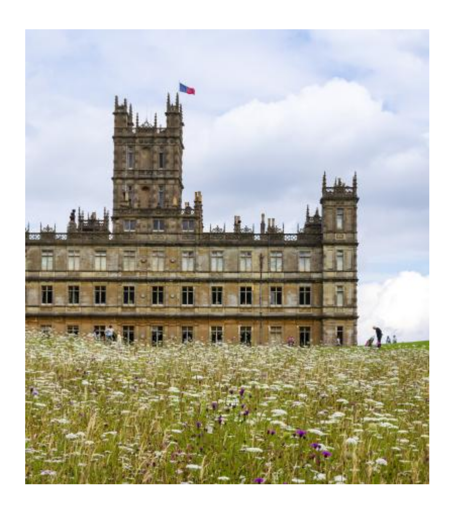
'Downton Abbey' Viewing and Tea