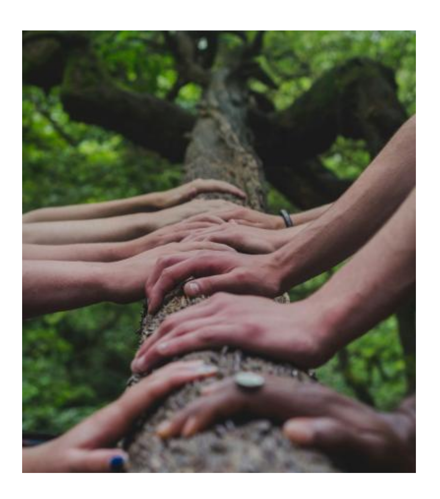
Hosting Public Policy Discussion