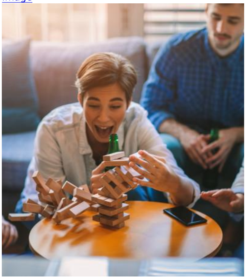
Game Night at the Library