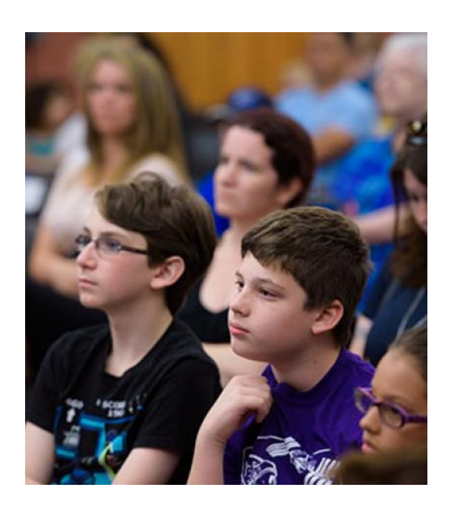
Live Video Chat with NASA Astronaut