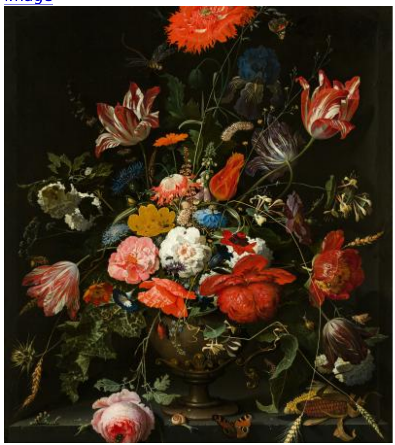
An Interview with the Magpie Librarian