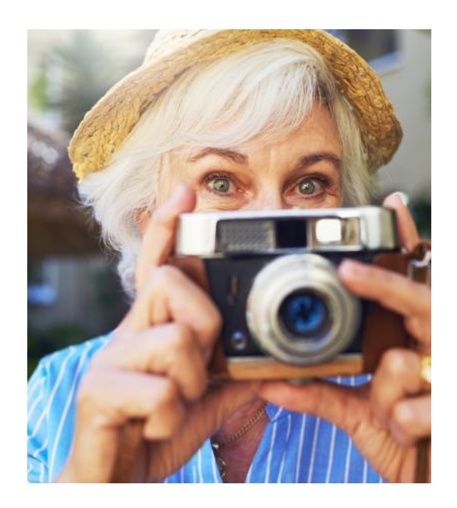
Arts4Life: The Art of Digital Photography