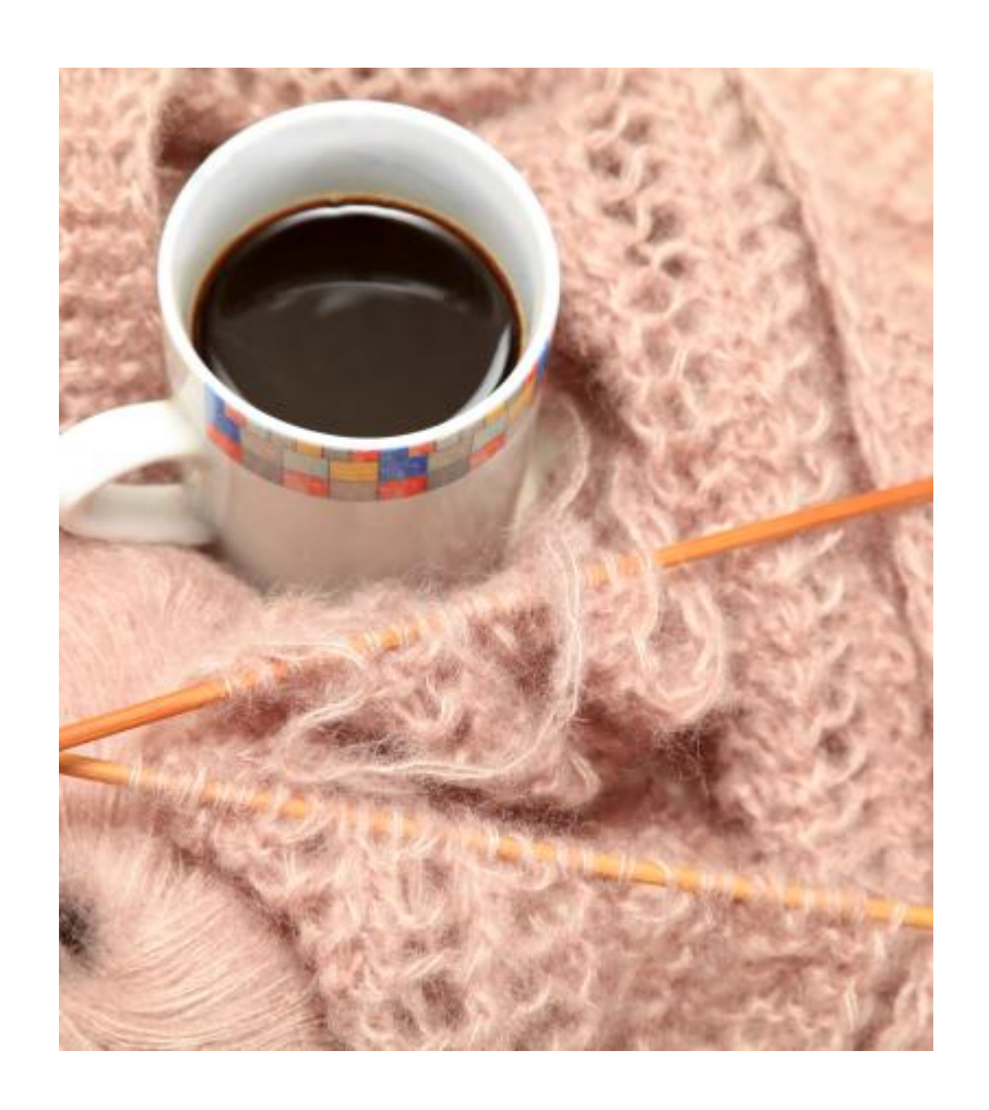
Chillin': Crafting it up with Cappuccinos