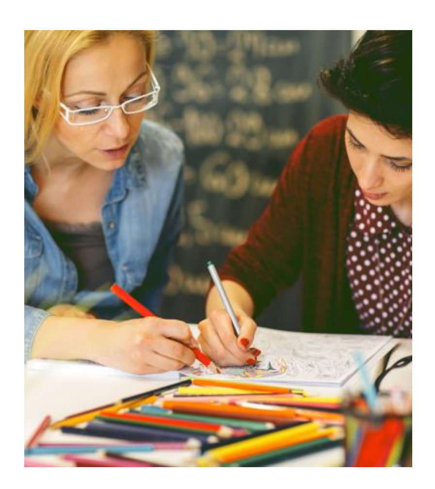
Adult Coloring Club