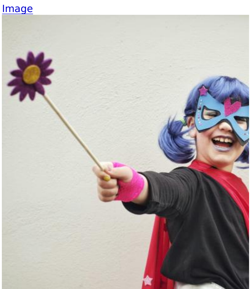
Literary Costume Party