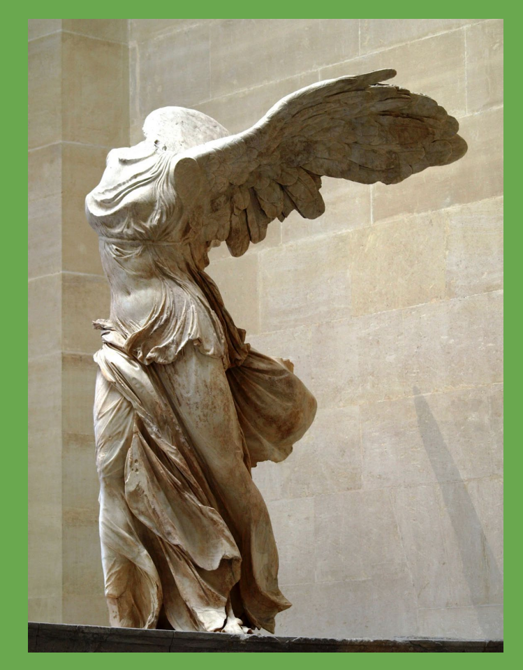
Winged Victory of Samothrace