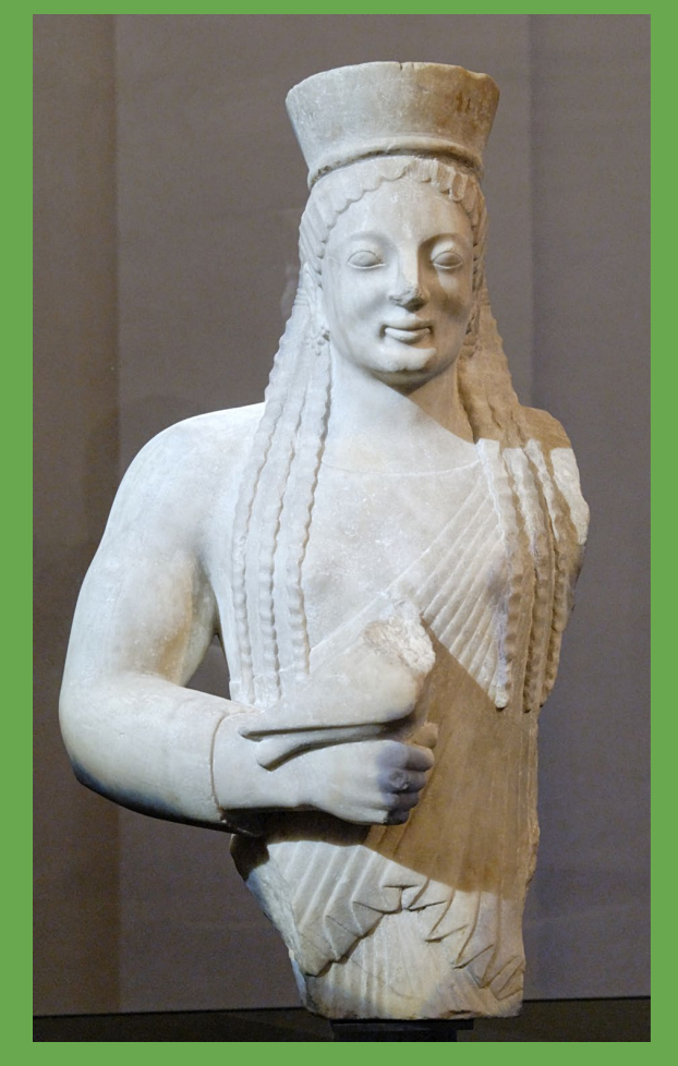
Kore of the Acropolis